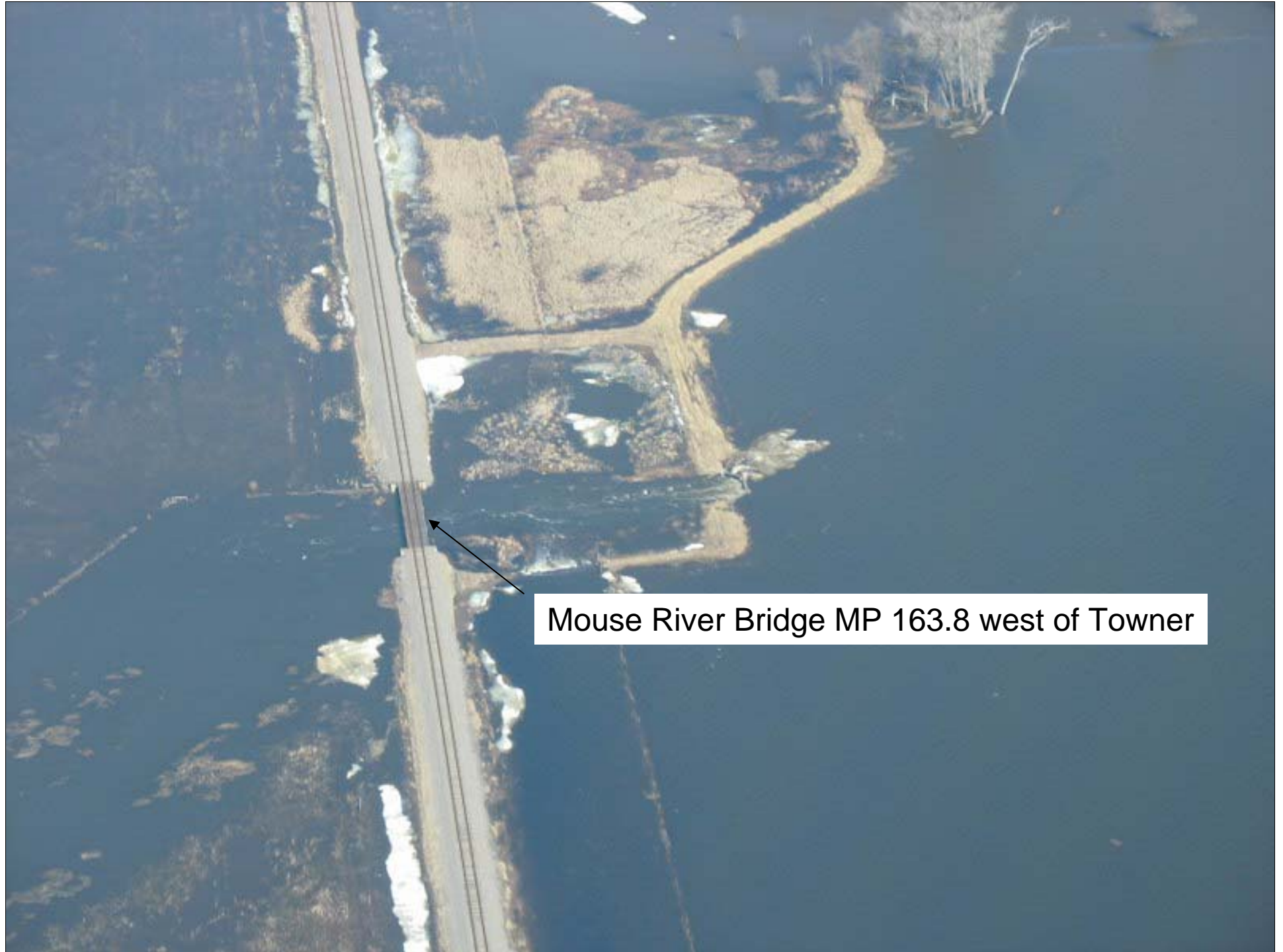
Mouse River Bridge MP 163.8 west of Towner