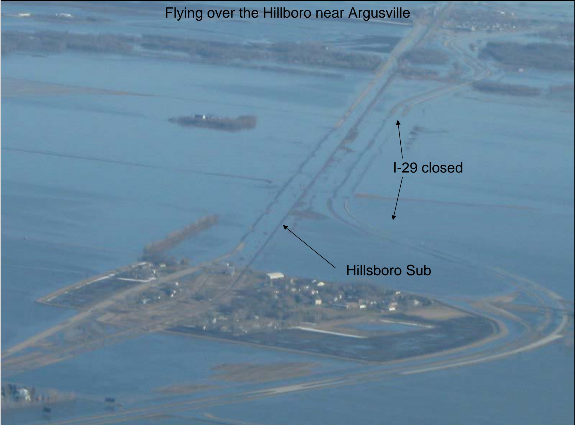
Flying over the Hillboro near Argusville