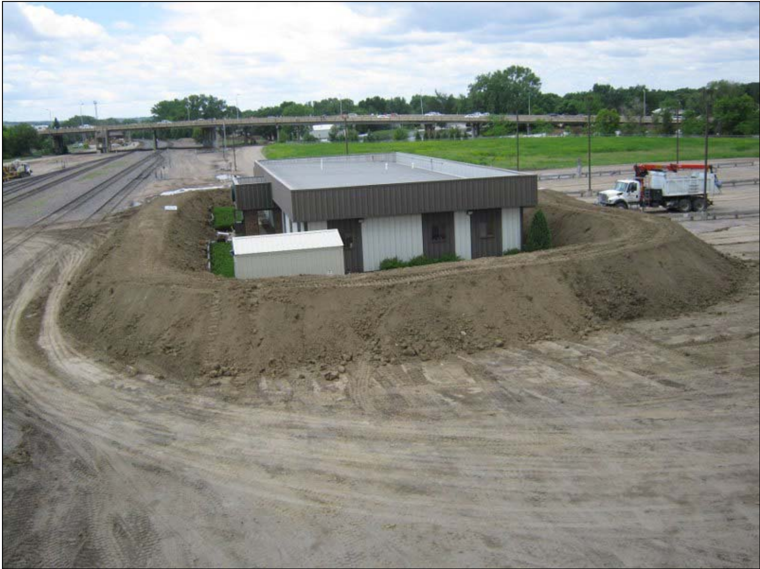
Dike built around BNSF General Office Building – Downtown Minot