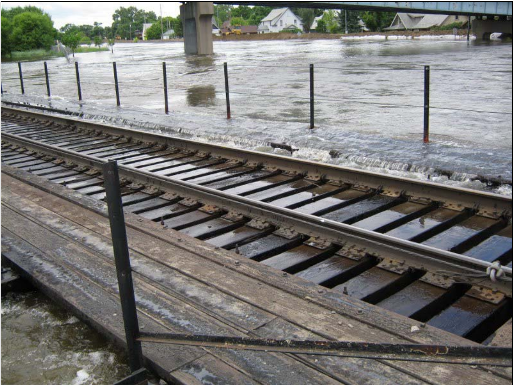
Flood water rising over mainline bridge crossing Souris River