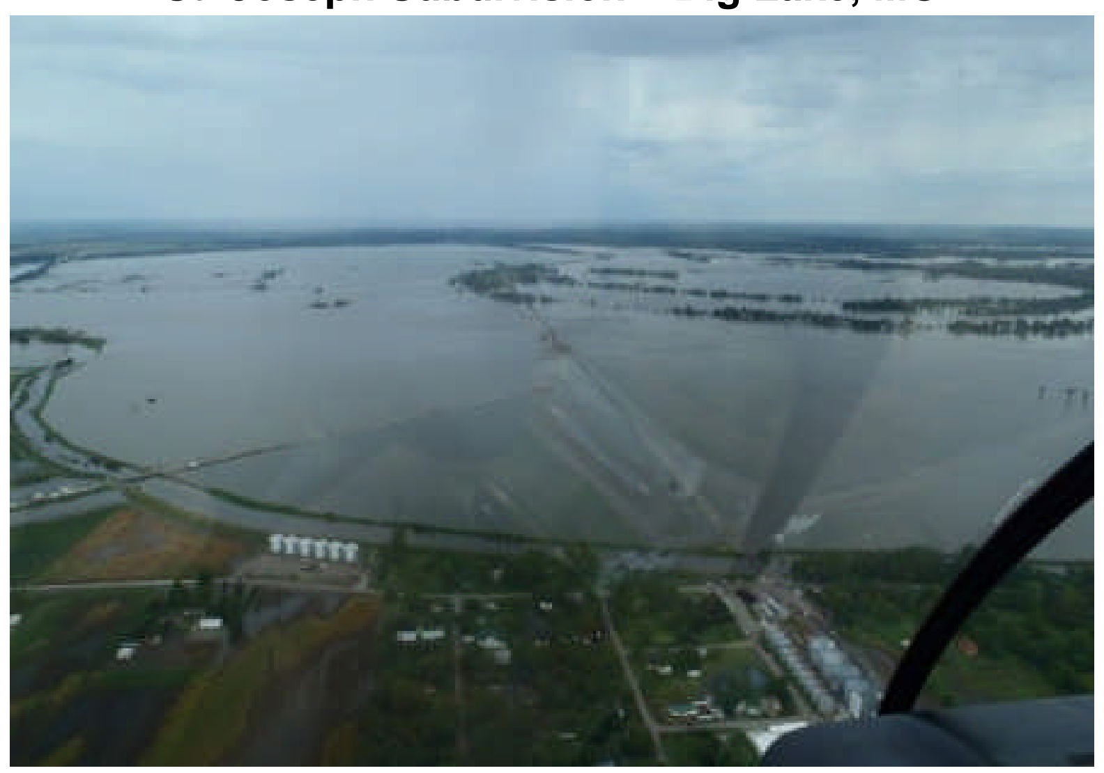
St. Joseph Subdivision – Big Lake, MO