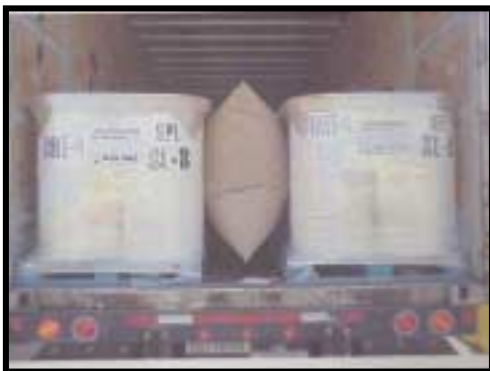
Improper Bag Installation

DID bags should never be installed adjacent to a trailer/container's sidewall. The sidewalls of trailers and containers have a great deal less strength than the endwalls of boxcars. Over inflating the DID bag(s) can easily distort, damage, and even destroy the sidewalls. While it is very important to inflate the DID bag(s) so the product is snug against the trailer/container's sidewalls, great care must be taken not to over-inflate the DID bag(s). Keep a close eye on the sidewalls during inflation so damage to the sidewalls does not occur.