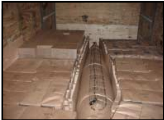
DID bag installed in center void

DID bags can be a very effective and economically feasible way of protecting lading from damage resulting from product movement in intermodal shipments. However, the practical use and installation of DID bags in intermodal shipments is quite a bit different than their use in boxcar shipments. In boxcars DID bags are installed in the longitudinal void to act as a type of "shock absorber" while for intermodal shipments the DID bags are installed in the center lateral void to control movement within the shipment. The key word here is "control." Using DID bags for intermodal shipments is not meant to